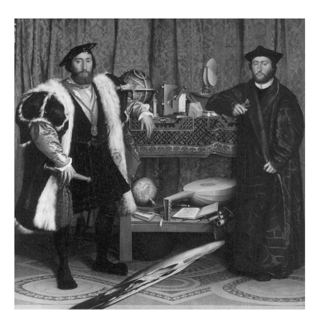
Figure 4. Hans Holbein, the Younger, "The Ambassadors" (1533).

All along, the issue of identity (false accusation, confusion with Kaplan, etc.) has been coupled with an architecture of visual inversion. We first meet Thornhill as a "man of the crowd," but he "stands out" as he stands up to the bell-hop's call for Kaplan. He becomes the focus of the police first by escaping the spies' attempt to kill him through the staged automobile accident; this focus is tightened when he is implicated dramatically as a murderer when Townsend is stabbed and falls into his arms in a very public reception room at the United Nations.