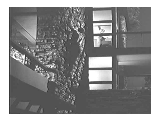
Figure 5. Thornhill hangs on to the stonework of the ultra-Modern house atop Mt. Rushmore.

Rushmore. Even here, Thornhill notes that "Teddy Roosevelt seems to be watching me!" Thanks to the cliff-sculptures' scale inversion, we have the perfect setting for the film's final architectural statement: an ultra-modernist house perched on the hills above the monument (Fig. 5).