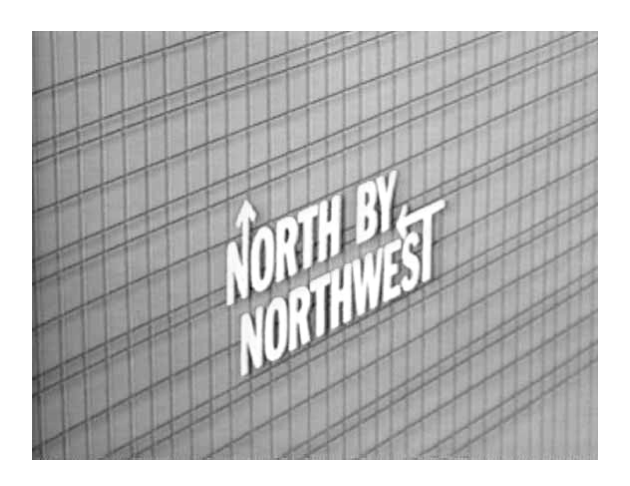
Figure 1. North by Northwest title frame.

How the uncanny works in practice can be demonstrated by one of Hitchcock's most famous (and most architecturally modernistic) films, North by Northwest (1959). NxNW whose very title suggests the uncanny theme of "looking awry" as related to madness begins with a visual-acoustic essay on the "angular" quality of modern urbanism.<sup>7</sup> The titles unfold to the spiky music of Bernard Herrmann in front of an aerial oblique view of a modernist glass façade (Fig. 1). In 1959, such a shot would be an unambiguous citation of modern architecture as such. The lines of text align with the oblique lines of the mullions, tensioning it graphically and metaphorically within the contemporary urbanity. This view cuts to scenes of crowds pouring down stairs, squeezing out of elevators and doors of office buildings into busy streets. Hitchcock plays his traditional cameo role as a would-be passenger who has just missed a bus.