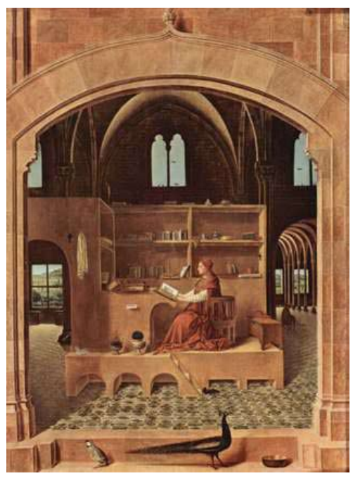
Antonello da Messina's painting of St. Jerome in his study uses frontal encadrement in multiple forms. The large arch enclosing the painting is neither in or out of the main space of representation, and the objects placed on its sill are clues about the saint's secret of translating Biblical texts. The carrel itself is a spatial frame that draws attention to how the building itself is used as a series of frames, where the windows are organized thematically. The shadow line that hits the edge of Jerome's carrel is, generally, a marker between "good" and "evil" objects. A carnation plant (carnation means "birth") is placed on the sunny side of this line, and possibly this part of the painting can be read in a linear left-to-right way. The partridge, peacock and golden bowl are placed to indicate iconic-religious meanings, but the partidge, which is a "bad" bird because of its lasciviouslness, does not seem to fit, but when we discover that the lore that the bird could be impregnated by the wind, it is possible to triangulate the higher meanings of the painting.