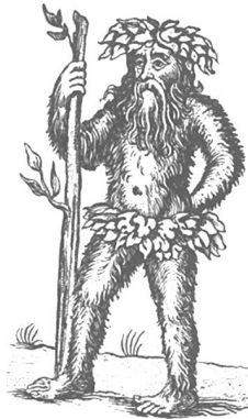
Figure 3. The wild man, demon of the field of affordance represented by the Medieval forest, embodied knowledge and therefore had to be tricked or tortured to reveal his secrets.

Love throws the causal chain and its double layered structure into crisis, but it also confirms it as the means by which “love” has been made the inevitable end of subjectivity by the clever ploy of making it an outlaw. 8 The causal chain is made by three “rings” — efficiency, finality, and materialized form — but the link between any two of these is, like the Borromeo knot Lacan used to characterize the unity of the Symbolic, the Imaginary, and the Real, reliant on the existence of a third . If this is put in terms of “the rival,” the case of René Girard is brought into discourse theory. This is the view that human culture in its entirety is grounded in the idea of singularity and challenges to singularity, which at the level of drama is the theme of the hero and his/her rival. In other words, singularity (identity, authenticity) is always shadowed , and in this shadow we see the historical-cultural operations of the uncanny: detached virtuality, fantasy formation, the unsettling of domesticity (the implicit fraying of the networks of symbolic relations).