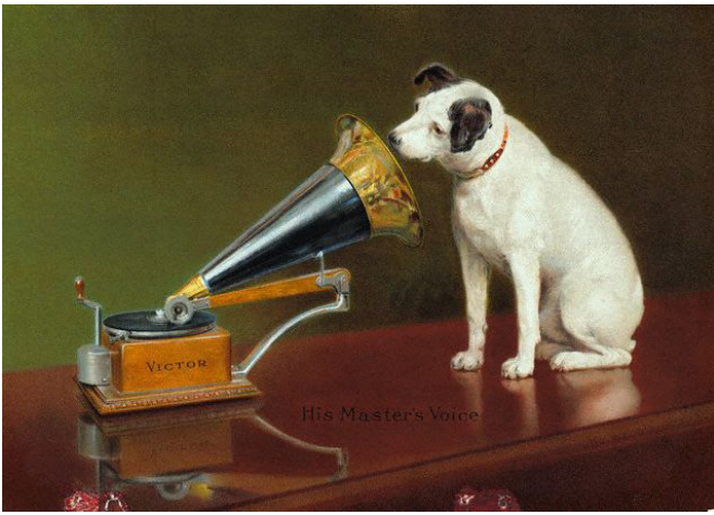
RCA Victor's graphic trademark was based on a true story of a deceased artist's brother who, touched by the brother's dog's melancholic recognition of a recording of his master's voice, painted the scene and marketed it to various recording companies. The voice is the a-phonetic but phonic component of the voice: that which cannot be reduced to a semantic relationship.

More striking partial objects involve positive manifestations of the negative. The invisible, which is normally just a technical shadow created by our point of view and limited sight, can be put into a special place where the 'invisible as such' has a three-dimensional existence. Cartoon characters can have their own hidden retreat in the American West or, more credibly, some communal hideaway can serve as a safe refuge for gangsters on the run. Here, we see application of the general rule: privation is converted into prohibition. What we can't see, experience, know, etc. is converted into something specifically prohibited to us, an irrational law denying us access (Kafka's The Castle and other works).