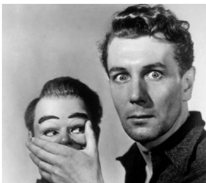
The subject's voice, notes Zizek, always involves a minimal element of ventriloquism ( Dead of Night , 1945).

The voice is no less an important marker for theory of cinema, where as the 'acousmatic' (unlocatable, off-screen) voice, it raises issues of placement, point of view, vanishing points, and other framing issues to the extent that editing, filming, story-boarding, and screen-play techniques can be integrated directly into discussions of the development of mind and the role of perception.