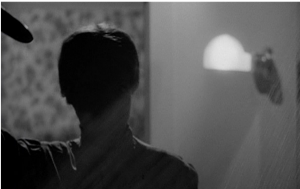
Alfred Hitchcock's Psycho provides many examples of 'partial objects'. Here, the son masquerading as the murderous mother, super-ego par excellence, appears, thanks to the shower curtain and water spray, as ectoplasm: that which is 'between the two deaths'. Lacan referred to this as the 'lamella', neither dead nor alive, the tissue that mediated the inner and outer worlds: the extimate.

If the uncanny is, as its German word, Unheimlich , suggests, self-negating, then a negative study method is suggested. Thus, the Surrealists are important not because of their product but because of their strategies — in particular, their failures. This leads directly to Raymond Roussel, whose works were notoriously despised but whose own account of his ingenuity far surpassed any apparent achievement.