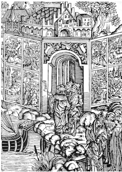
Figure 5. Publii Virgilii Maronis opera cum quinque vulgatis commentarii (1502) Strasbourg: Johann Grüninger. Re-drawing by author, from the Keir Collection of Medieval Works of Art. The door to the underworld, simultaneously a paradigm of Lacanian extimity, is shown here in its narrative function as the ultimate plot point.

protected interior and interring the wild reaches beyond, the demons of the outer world are given a premature burial. The idea of demon is, in fact, correlative to this thin space. Despite the fact that the pomærium had to have some thickness to allow priests to complete their circling ritual, the space was effectively that of the Möbius band: a double circuit in terms of motion, a single circuit in terms of closure. The city's spiritual insulation depended on the ability to move in Euclidean space and projective space-time simultaneously.