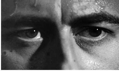
Figure 1. 'Oscar's moment of decision', when the bridegroom in Fellini's Nights of Cabiria tips his hand by locking his eyes onto the large roll of cash that Cabiria has just taken out of her purse to pay for dinner. The audience and Cabiria know what he has in mind: to walk his new bride to a lookout point, grab her purse, and push her over the cliff. This foreshadowing tensions the short walk with such suspense that the release (Cabiria's survival) is felt, both by her and the audience, as purified joy.

they are thinking. In this accelerated moment, the thoughts of the sympathetic character and the audience that sympathizes are one collectively owned thought because it is originally one, a shared one, the fact of being shared. This 'one' of dianoia literally 'counts as 1', not as a uniting of two things but as an 'idempotency', the power to remain the same , thanks to being held in suspension by two parties, two opposing states.